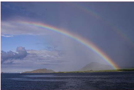
Double Rainbow