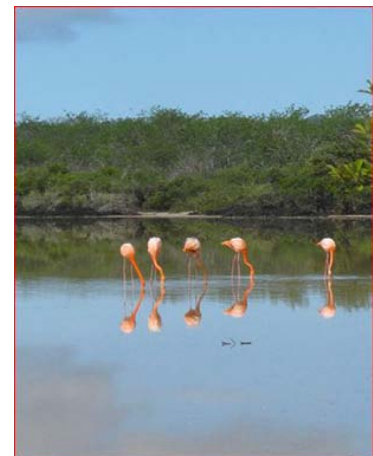
Flamingos (J. Grant)