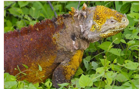
Land Iguana