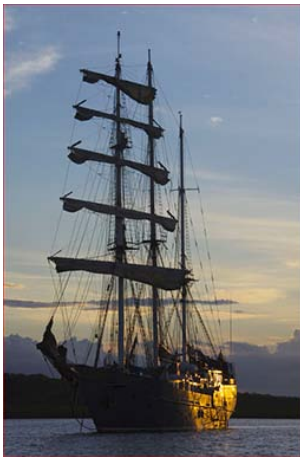
Mary Anne at dusk