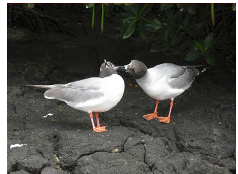
Swallowtail Gulls preening (J. Grant)