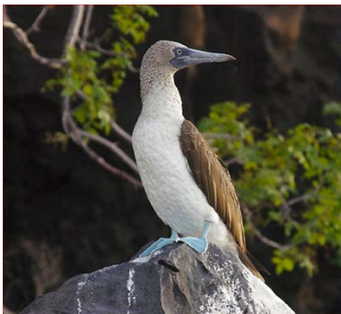
Solitary Blue Footed Booby (J. Grant)