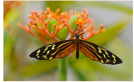
Sacha Lodge Butterfly

The Galapagos Islands today is a National Park and is tightly controlled to protect its native wild life. Most tourists visit by boat. Access to each island is allowed but visitors must stick to pathways and beaches assigned by park management. This is not a problem, however, because the animals do not fear humans and are quite willing to be photographed at close range. They are so tame, in fact, that humans have to be careful not to step on them. The fauna is unique on each island where dramatic pictures of Blue Footed Boobies, Giant Tortoises, Marine Iguanas, Waved Albatross, Galapagos Penguins and many more species are easy to take. The islands are very beautiful on their own and offer wonderful landscapes. My husband, Alan, and I visited Ecuador and the Galapagos Islands in February, 2012 and were lucky enough to get to the high Andes, rain forest, cloud forest and Quito. We took thousands of pictures in the 3 weeks we were there and truly enjoyed ourselves. I should mention that the people are very friendly and welcoming and the guides speak good English. Ecuadorians are eager to teach you about their wonderful country and are pleased to pose if you want to photograph them.